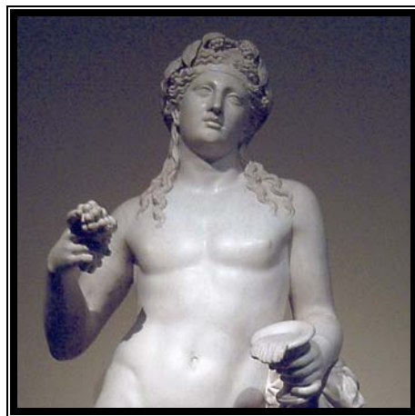
Ancient statue of Dionysus holding grapes and spilling wine (c. 150 AD)

Actually the New Year babe is far older than he looks. In ancient Greece, it was customary at the great festival of Dious to parade a babe cradled in a winnowing basket. This was taken to symbolize the annual (or periodic) rebirth of that god as the spirit of fertility!