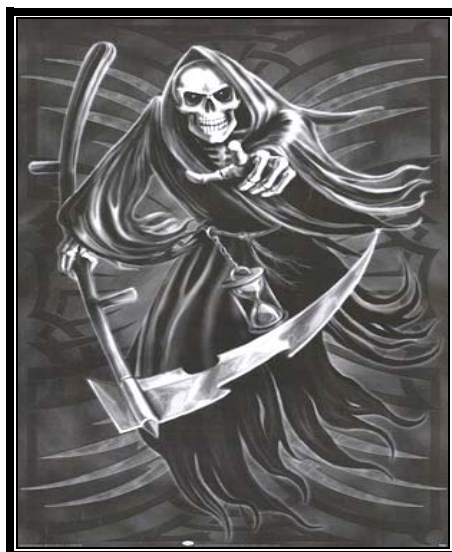
The Grim Reaper