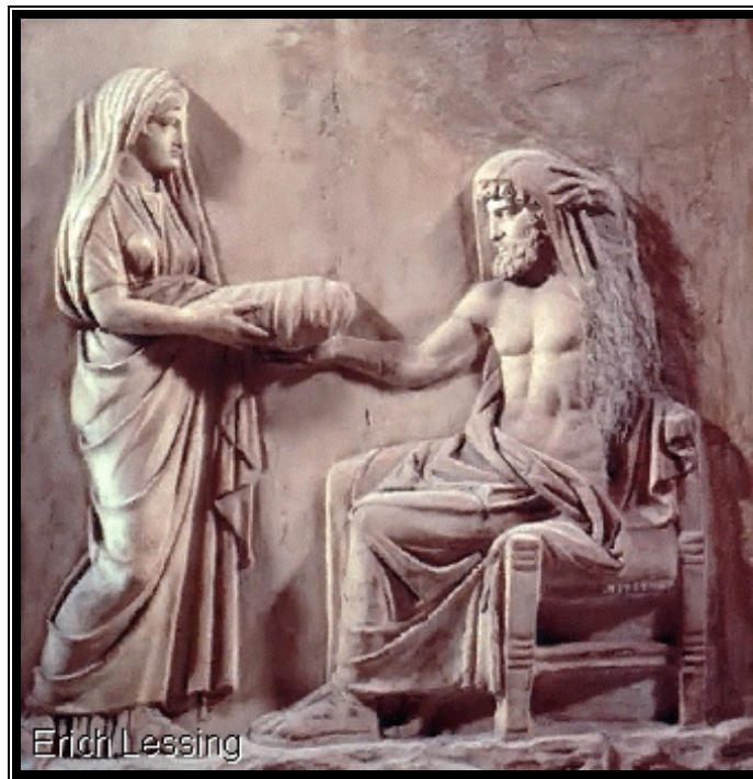
Ancient relief of Rhea handing Cronos a baby

Cronos killed his father and ruled heaven. He felt like he was the king of the universe (which he was) until one night, he fell asleep and had a dream that his kids overthrew him and all the other Titans. When he awoke, he told the story to his wife, and she told him not to believe in dreams. But Cronos didn't listen; he thought up a plan to get rid of his children. A couple of months later, his daughter, Demeter, was born. Cronos said to his wife, "Rhea, pass the baby to me please." Rhea passed the baby to Cronos and, Cronos gobbled the baby up. Then he ate Hades, Hera, Hestia, and Poseidon. But, the last baby, Zeus, wasn't eaten. Rhea hid him under a cot and wrapped a rock in a baby blanket. She put the rock in a cradle, and Cronos... ate the rock instead of Zeus. Later, when Zeus had grown up, he arranged for Cronos to drink a potion that caused Cronos to vomit all the babies, who somehow lived ( ballpoint.org/greekgods/cronos.htm ).