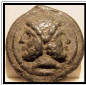
Republican coin showing Janus

Janus was thought to be the one who presided over everything that is seemingly double edged in life. He represented the transition between that which was primitive and the advancement of civilization. As the god of beginnings and endings, Janus was invoked at the start of each day. In the perspective of this history, it is obvious how this false god eventually came to play a role in our designation of the new year.