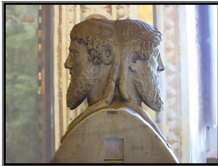
Bust of Janus from the Vatican Museum

He (Janus) was also known as the figure representing time because he could see into the past with one face and into the future with the other. Hence, Janus was worshipped at the beginnings of the harvest and planting times, as well as marriages, births and other beginnings. He was representative of the middle ground between barbarity and civilization, rural country and urban cities, and youth and adulthood ( http://en.wikipedia.org/wiki/Janus_(mythology) ).